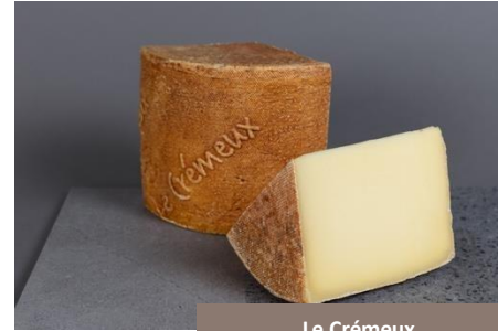
Le Crémeux Fromagerie Moléson

The name says it all! A cheese that exudes indulgence... Enriched with cream and matured for several months, it offers a smooth texture and a lovely lingering finish. A generous product with a distinctive flavour that breaks away from the traditional norms of pressed cheeses.