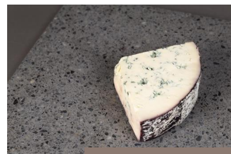
BluDivino Caseificio Pier Luigi Rosso

A blue cheese unlike any other, matured in Barbera d'Asti red wine. The result: a cheese with deep aromas and a melt-in-the-mouth texture that is almost indulgent. Halfway between cheese and dessert, it surprises with its intensity and finesse. A unique experience, designed for those who love to discover new flavours.