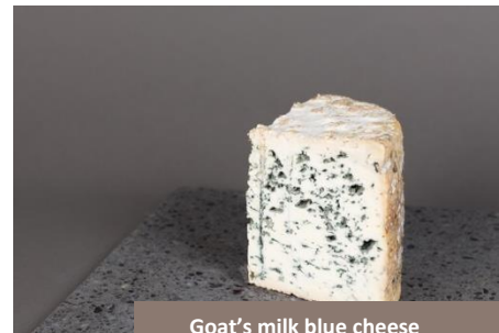
Goat's milk blue cheese Société Laitière de Laqueuille

A blue cheese that redefines the very conventions of its kind. Made from goat's milk, it combines mildness and character in a surprising balance. Both creamy and slightly intense, it offers an original alternative to more traditional blue cheeses. Ideal for adding variety to your dining experience, it pairs very well with a little honey or dried fruit.