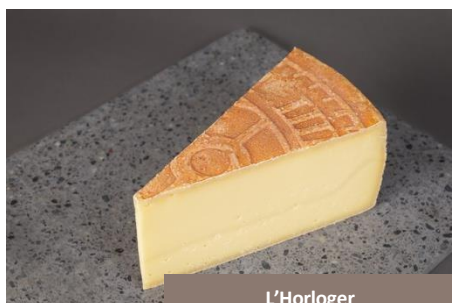
L'Horloger Fromages Spielhofer

A cheese inspired by Swiss watchmaking, where everything is a matter of time and precision. Its pressed texture reveals a subtle, balanced flavour. Its appearance, inspired by a watch face, makes it a unique product, as beautiful to look at as it is enjoyable to share on a cheese board. Its added bonus? It can be cut minute by minute according to weight.