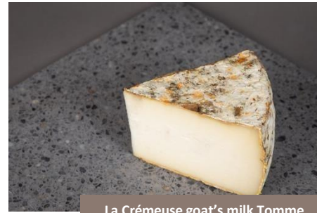
La Crémeuse goat's milk Tomme Prolactine Cave Rousseau

A wonderfully mild Tomme, defying all preconceptions. Its maturation in a natural cellar gives it a unique flavour profile and delicate, slightly fruity aromas. A cheese loved by all, whether enjoyed on its own, on a nice slice of bread or with some fruit.