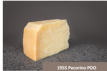
1955 Pecorino PDO Busti Formaggi

This is the full force of Italy! Matured for a long time, this Pecorino PDO reveals a richness and depth that unfold as you savour it. Mild at first, then becoming more intense, it develops notes of butter and dried fruit that linger on the palate. A cheese with character for those who love a good discovery.