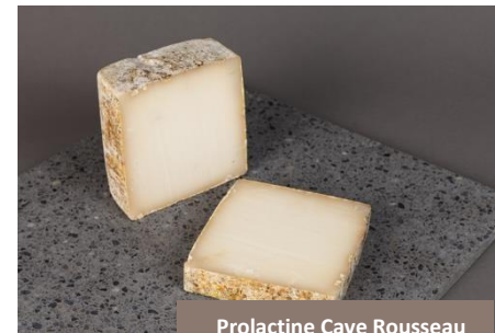
Prolactine Cave Rousseau Goat's brique

With its original shape and creamy texture, this tomme puts a new spin on the classics. Artisanally matured in Chambéry, its mild character develops with a gently sweet finish.