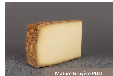
Mature Gruyère PDO from Les Forts de la Tine Huguenin Fromages

Matured between 18 to 22 months, this Gruyère PDO reveals the full richness of raw milk. Its firm texture and powerful aromas make it a cheese with character and one that is particularly addictive. A great classic taken to the highest level.